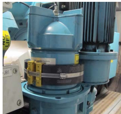
Typical FilterMag XT8PR Installation on the gearbox oil filter. A stainless steel band clamp is used to secure the XT8s to the aluminum filter housing.