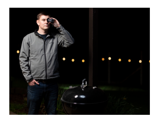
EXPLORE LIKE NEVER BEFORE