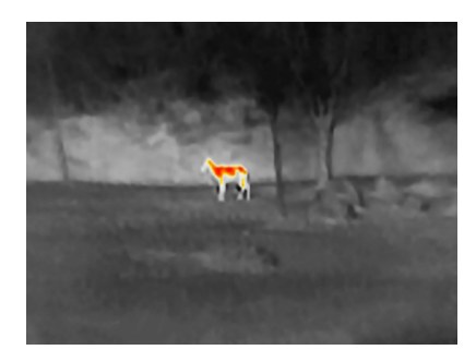
InstAlert: The hottest object in the image is colored while everything else is greyscale