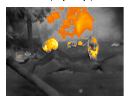
Graded Fire 1&2: The hottest things in the image are shown in a gradient of color while everything else is greyscale