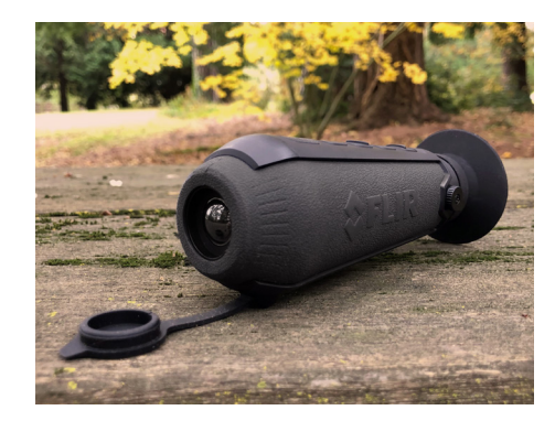
GRAB AND GO SIMPLICITY

Starts up in seconds, no training required