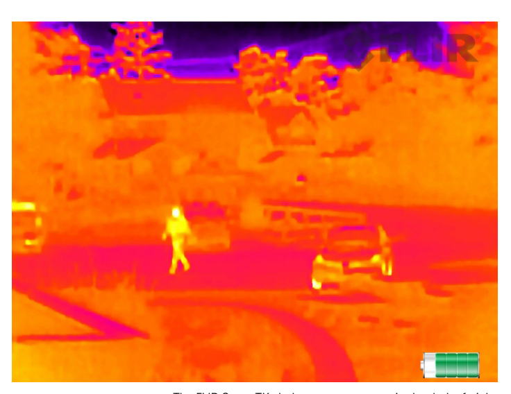
The FLIR Scout TKx helps you stay aware in the dark of night

The FLIR Scout TKx is a pocket-sized thermal vision monocular for exploring the outdoors at night and in lowlight conditions. This thermal monocular with an extended battery life reveals your surroundings, allowing you to clearly see people, objects, and animals from more than 90 meters (100 yards) away. The Scout TKx records thermal images or video in multiple color palettes that can enhance viewing, including InstAlert<sup>TM</sup>—a greyscale palette that adds color to highlight the hottest object in the scene. Simple to use, the Scout TKx is the perfect companion, whether in the countryside or on your own property.