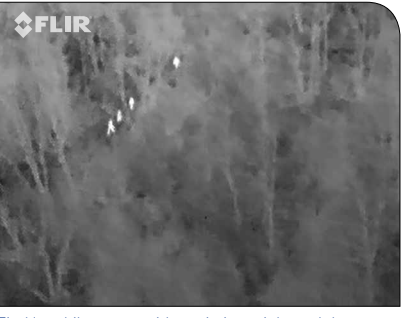
Find lost hikers or accident victims night and day.

Two kits are available so you'll be sure you to have the capability you need, when you need it.