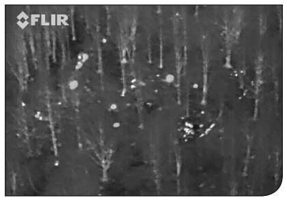
Assist mop-up crews by finding underground hot spots that could flare up.