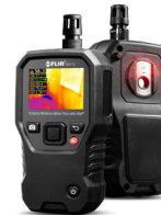
FLIR MR176 IGM™ Moisture Meter with Replaceable Hygrometer