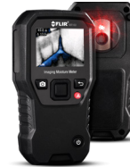
FLIR MR160 FLIR Imaging Moisture Meter