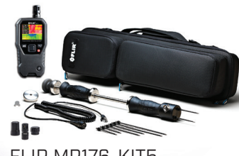
FLIR MR176-KIT5 Professional Imaging Moisture Kit