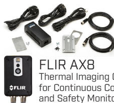
FLIR AX8 Thermal Imaging Camera for Continuous Condition and Safety Monitoring and Starter Kit