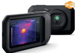
FLIR C3-X Compact Thermal Camera with Cloud Connectivity and Wi-Fi