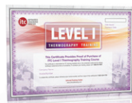
ITC in person training Level I Thermography Course