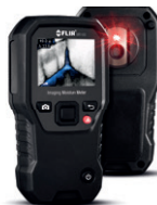
FLIR MR160 FLIR Imaging Moisture Meter