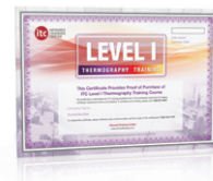
ITC Online Level I Thermography Course