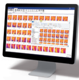
FLIR Thermal Studio Pro 1 year Subscription