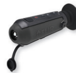
Scout TKx Thermal Imaging Monocular