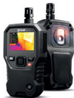
FLIR MR176 IGM ™ Moisture Meter with Replaceable Hygrometer