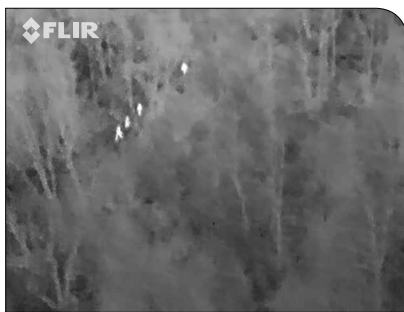
Find lost hikers or accident victims night and day.

Unmanned Aerial System (UAS) equipped with a thermal imaging camera for First Responders