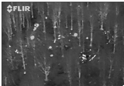
Assist mop-up crews by finding underground hot spots that could flare up.

With FLIR's new Aerial First Responder Kits, drone-based thermal imaging is easier to access than ever before.